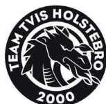
Team Tvis Holstebro (DEN)