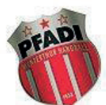
Pfadi Winterthur (SUI)